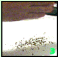
Rub some mint