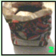
Get rubbing mint